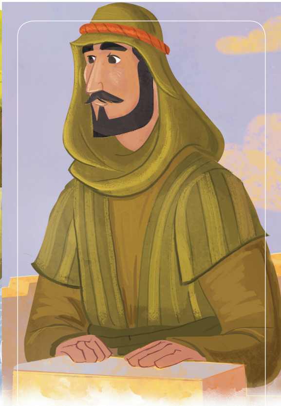
Habakkuk the Prophet