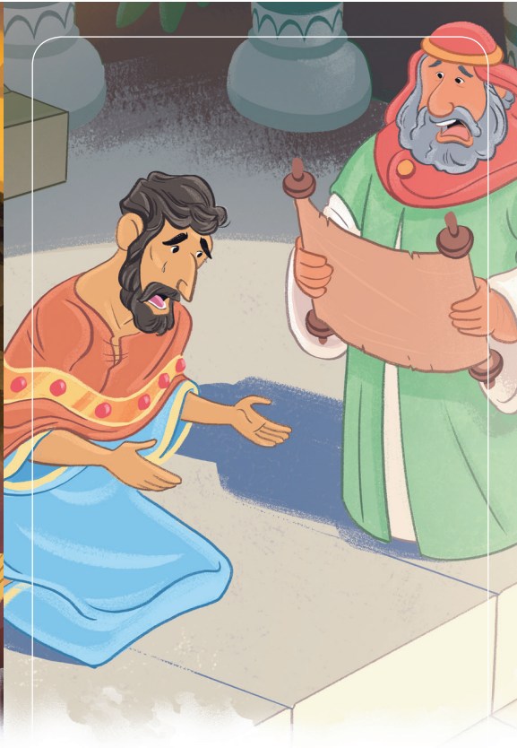
Hezekiah and Josiah